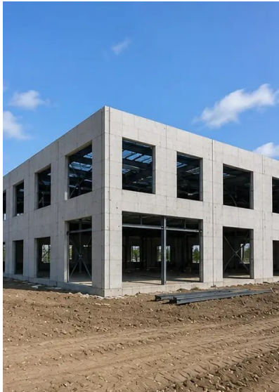
00 №9. Structural frame completed according to project schedule