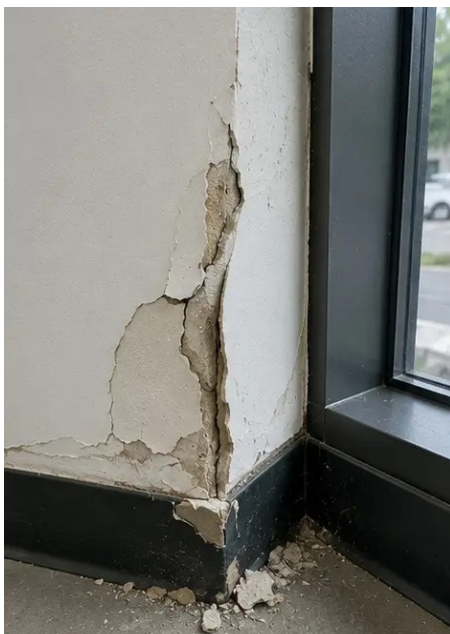
Photo #15. Identified defect area documented for further evaluation