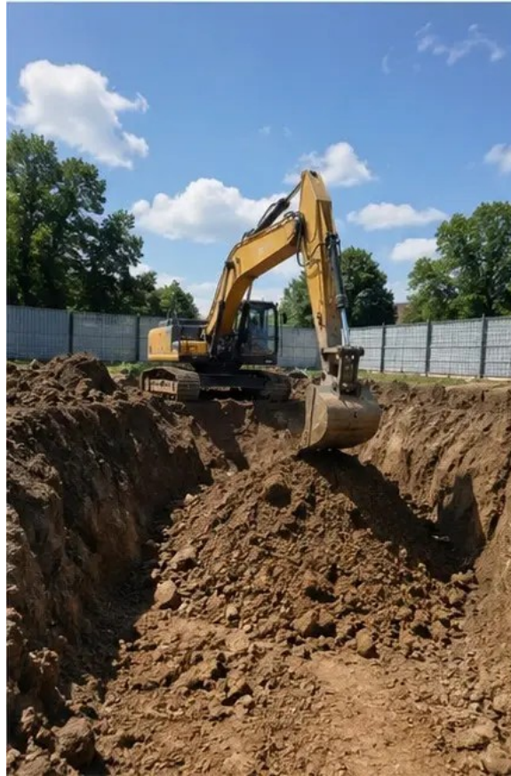
Photo #2 Excavation work performed according to project requirements