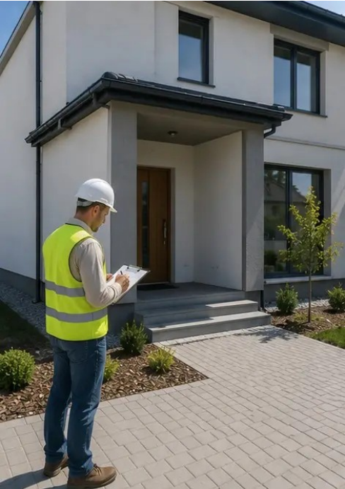
ready for operation