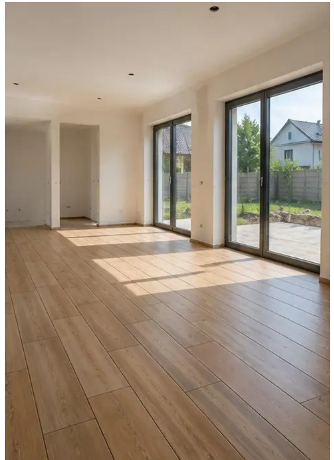
Photo #12 Flooring installation completed according to project specifications