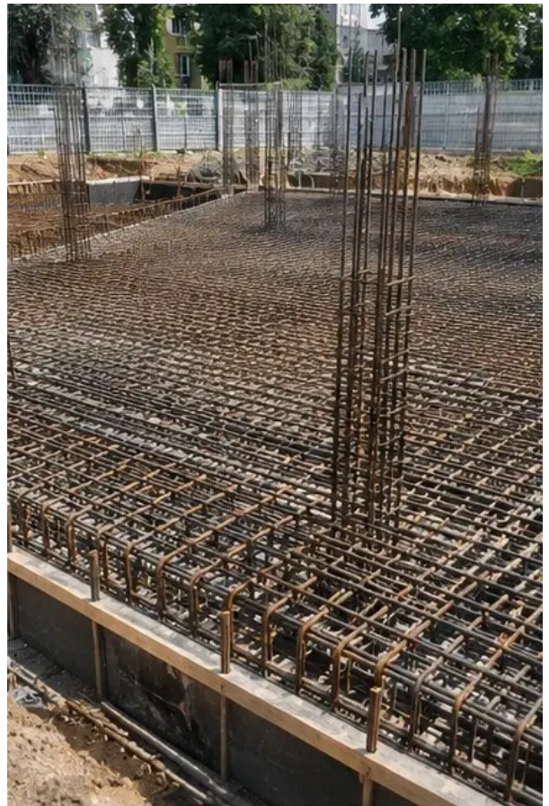
Photo #4 Reinforcement installation completed before concrete pouring