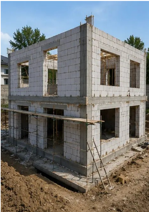
Photo #7 Exterior wall construction completed for the building section