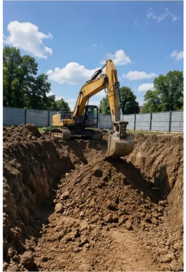
Photo #2 Excavation work performed according to project requirements