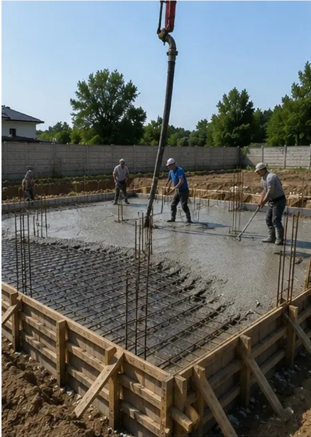
Photo #5 Concrete pouring operation performed on foundation elements