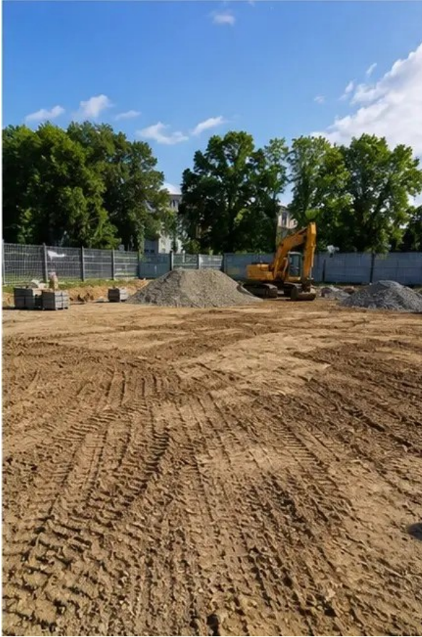
Photo #1 Site preparation work completed before the start of construction