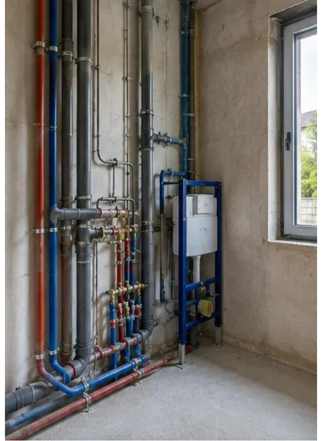
Photo #10 Plumbing systems installation completed in designated areas