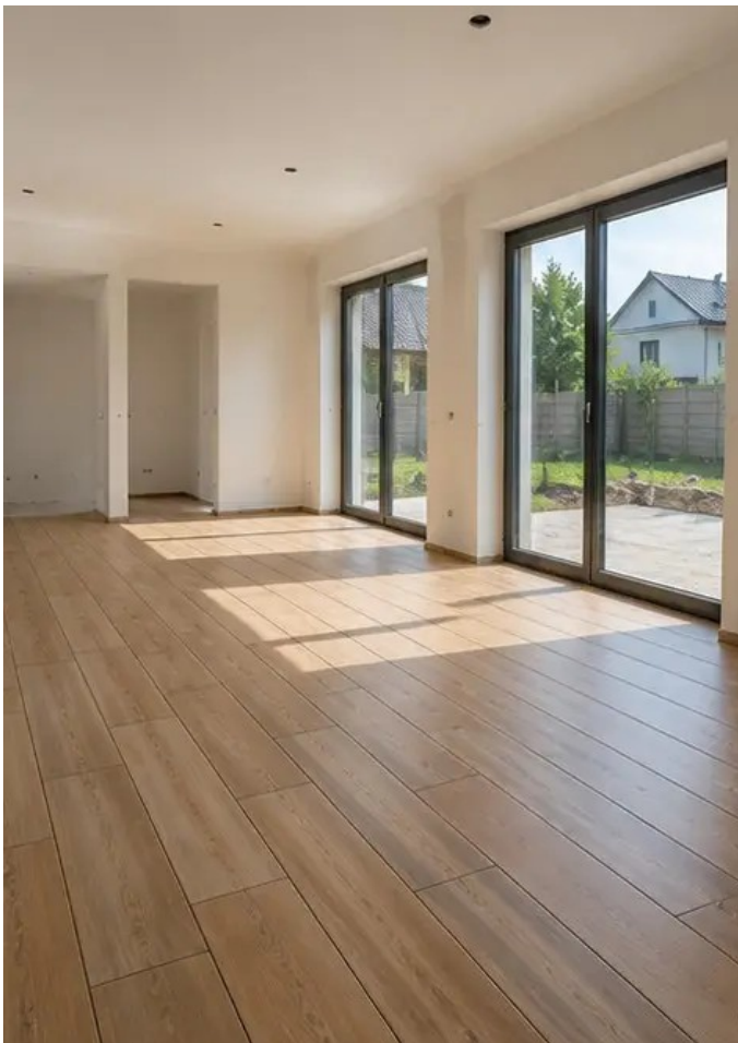
Photo #12 Flooring installation completed according to project specifications