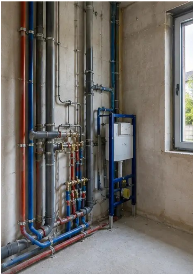
Photo #10 Plumbing systems installation completed in designated areas