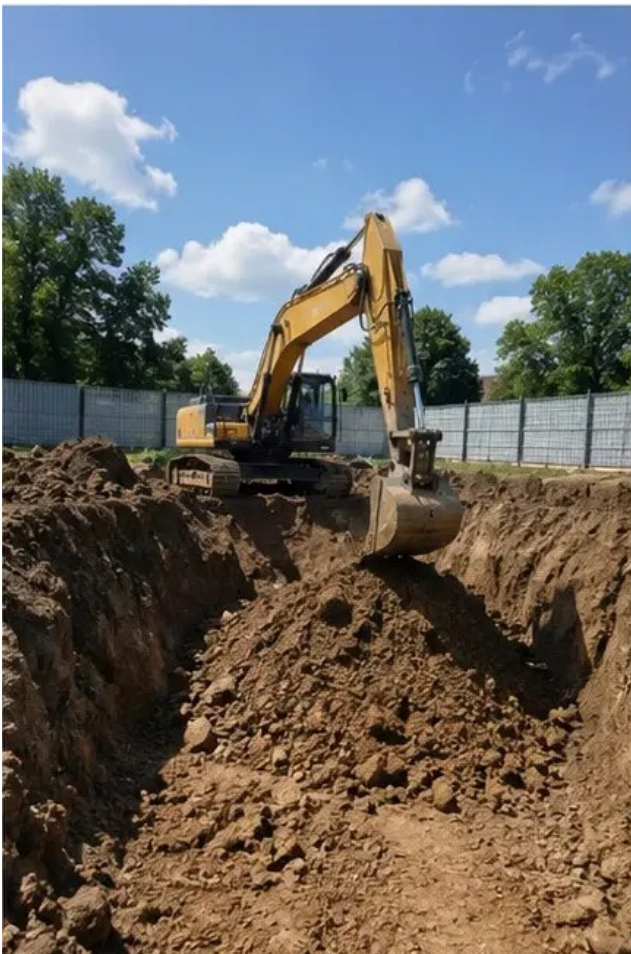
Photo #2 Excavation work performed according to project requirements