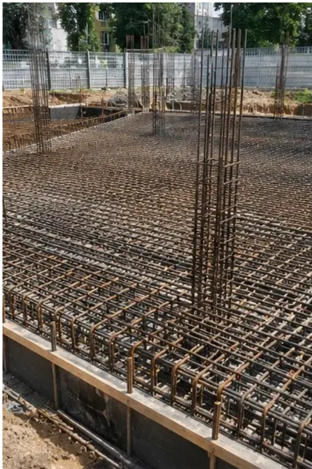
Photo #4 Reinforcement installation completed before concrete pouring